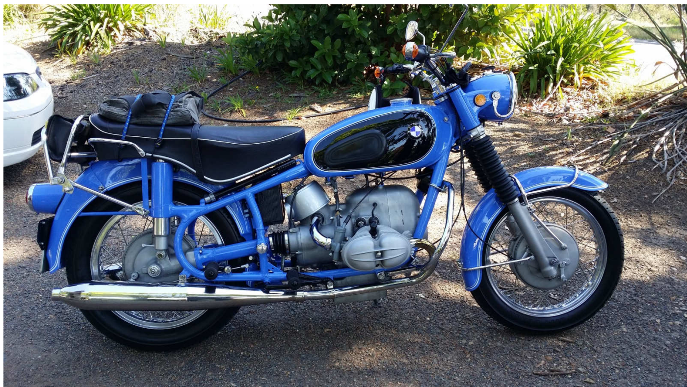
PHIL VERGISON'S 1968 BMW R69 US