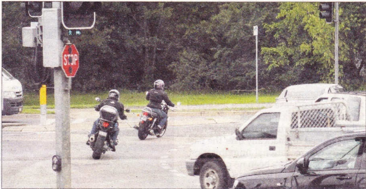
Motorcyclists will be allowed to filter to the front of traffic