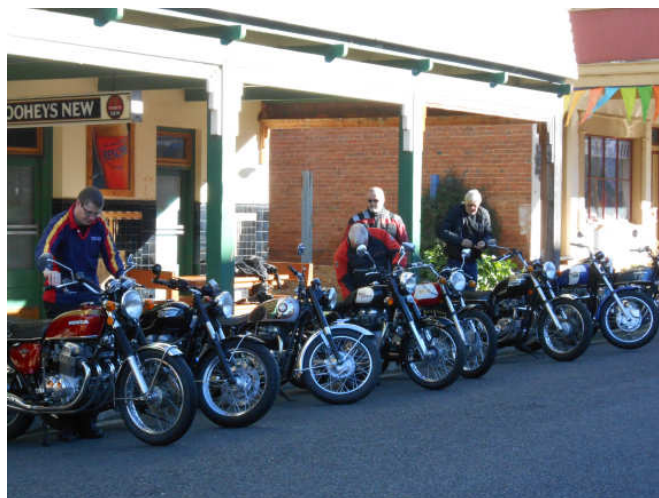
ARRIVING AT THE HOTEL IN CARCOAR

2. This proxy must be in the hands of the Secretary no later than 8-00PM.on24TH.day of NOV 2013.... (i.e. at least 24 hours prior to the meeting.