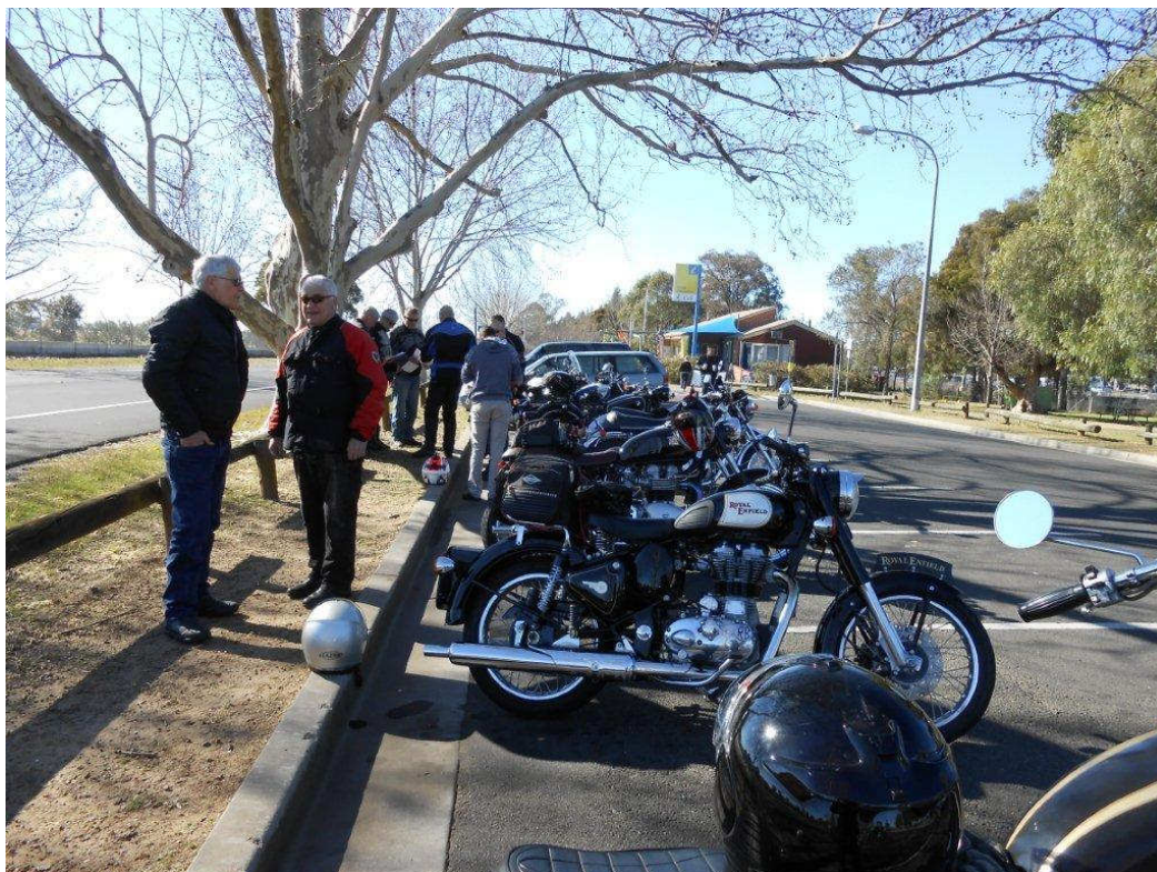
STARTING POINT OF THE RIDE TO CARCOAR