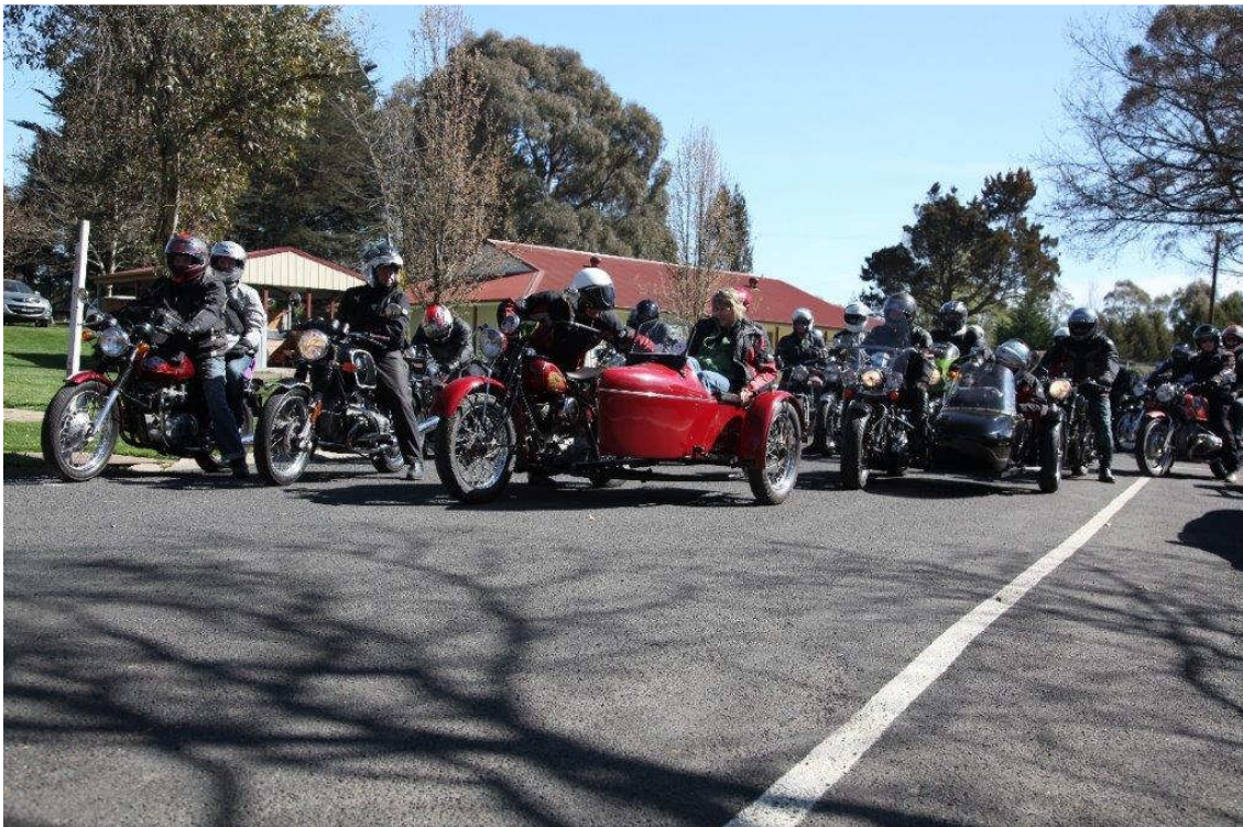
Ready for the start of the Oberon tour ride