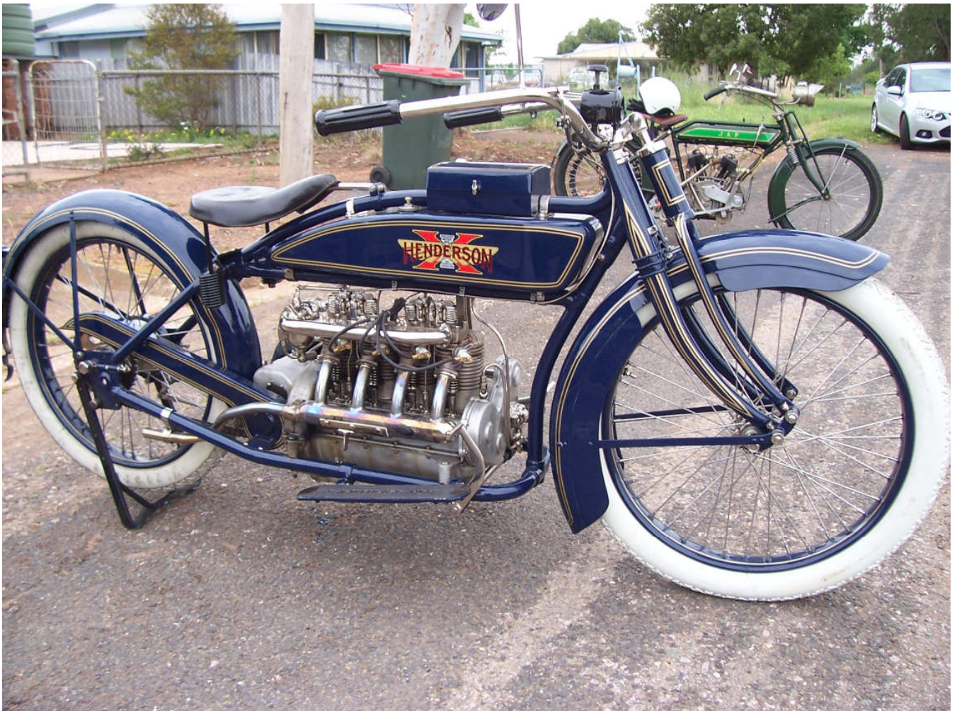
PHOTO FROM THE NATIONAL VETERANS RALLY HELD AT PARKES 2013