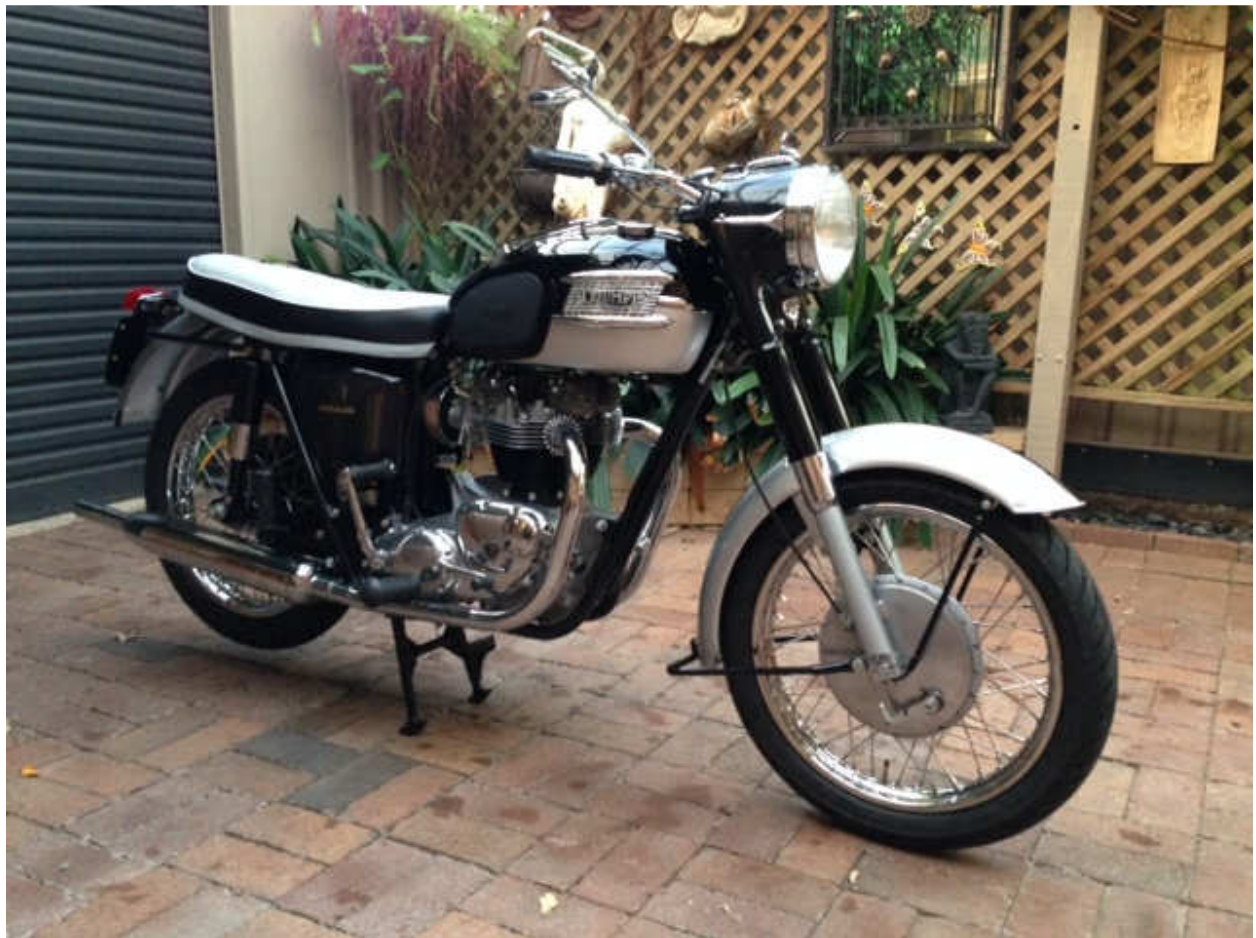
TERRY REILY.S RECENTLY RESTORED 1965 TRIUMPH THUNDERBIRD